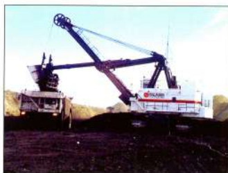
Humic material can be extracted from soft brown coal-like deposits called leonardite, found with lignite coal.

There is no one single chemical known as humic acid, since the chemical structure has never been completely defined. These materials are composed of complicated organic mixtures which are linked together in a random manner, resulting in extraordinarily complex materials (Figure 1). It has been suggested that no two molecules of humus are exactly the same. The