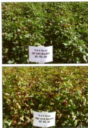
Figure 3. Cultivar differences in canopy appearance at 114 days after planting in 2004 at Jackson, Tennessee.